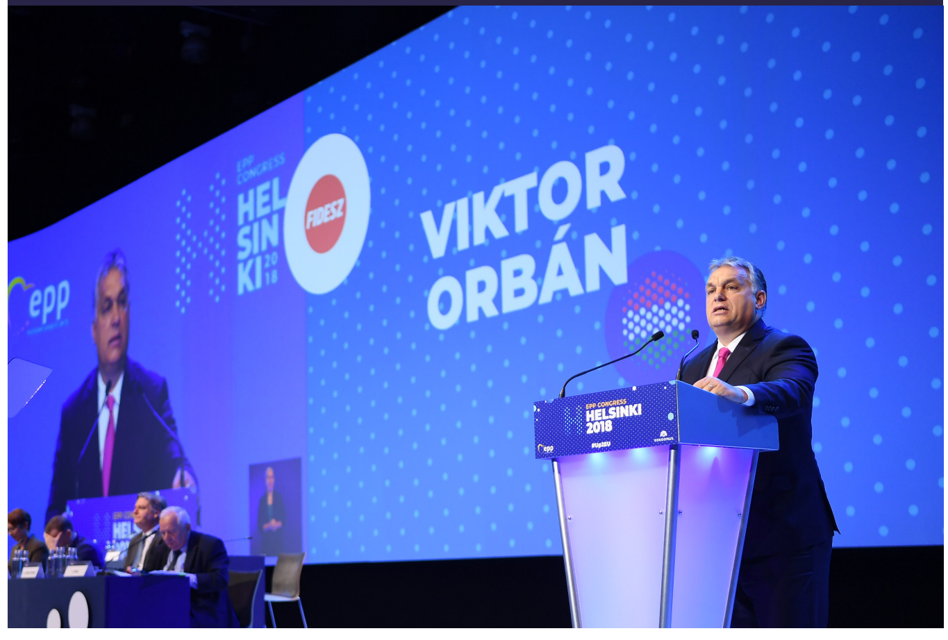
Photo: Viktor Orban, Prime Minister of Hungary speaking at the European People's Party Helsinki Congress in 2018

was a newly created state after the fall of value to the debate. As of the beginning the Republic of Yugoslavia).