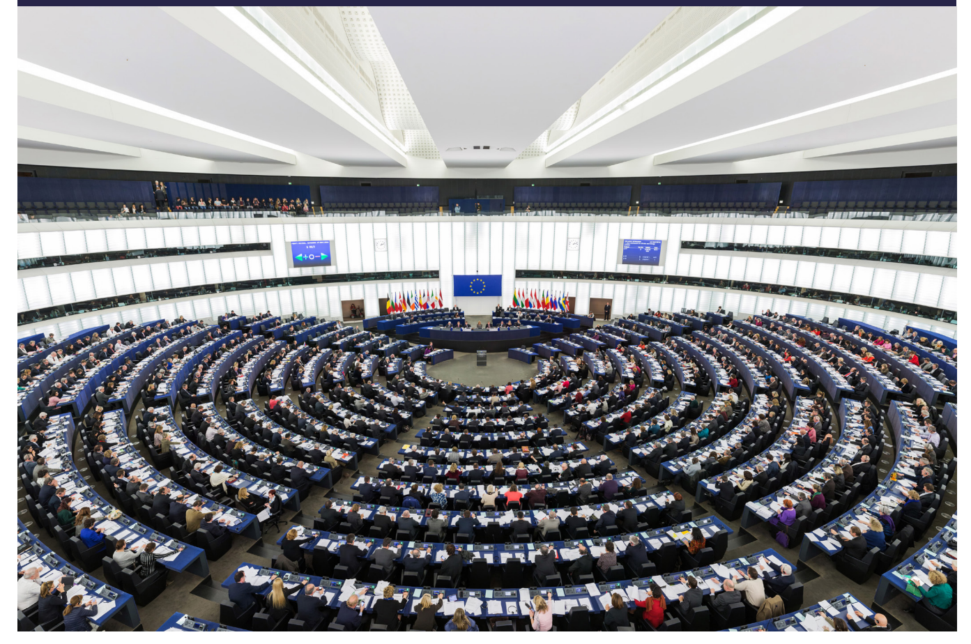
Photo: The European Parliament building located in Strasbourg, France

are therefore unlikely to throw or give away what they have obtained only too recently".